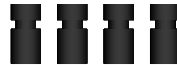
M3*8mm Silicone Grommet x 4