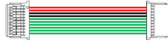
SH1.0 10-pin 35mm Cable x 1